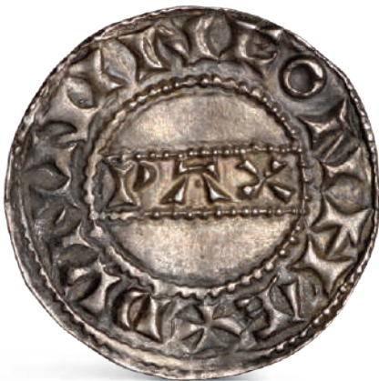
The top-selling Harold II penny of 1066 that was struck at Hastings (S-1186). Graded EF it realised $47,140 in Noonans British Coins and Tokens Auction on 19 September. The legends read: obv. HAROLD REX ANG, rev. +DVNNING ON HÆ.