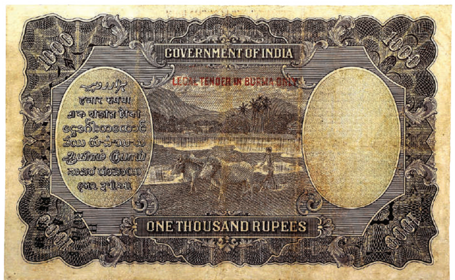
Face and back of the ultrarare 1928 George V India 1,000 rupees (P-12) overprinted in 1937 for circulation in Burma only (NIP). Certified PMG Very Fine 25 Net is realised $63,355 at Maastricht.