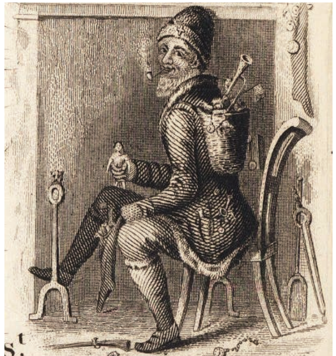
Just three examples are known of this rather thin, if not scrawny Type VI Santa. All are on notes of New York's short-lived Knickerbocker Bank. This example of a $2 proof fetched $25,300 in PCGS Very Choice New 64PPQ.

It wasn't long before the new image was being enlisted to promote commercial products. These included banknotes.