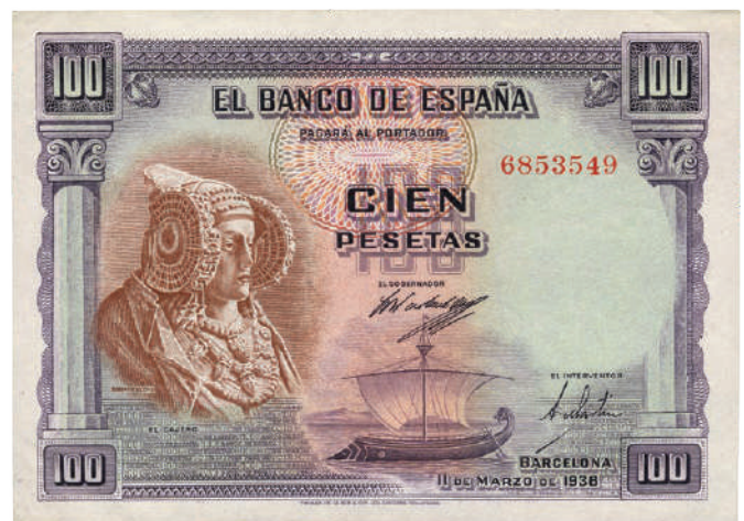
Face of the extremely rare, Spanish 100 pesetas, P-90, sold by Spink in April 2013 for $11,383 and by Heritage Auctions for $30,999 in 2017. Dama de Elche provides the vignette at left. Note the Thomas De La Rue imprint.

At lower centre the note's face shows a galley from Greece's archaic past complete with sail and steering oars. From its size it is possibly a triacontor, a vessel with thirty banks of oars, or maybe one of the later derivatives. Like the larger pentacontors these were long-range, versatile ships used both for military and trade purposes. They provided ideal vessels for a little light colonising along the Mediterranean littoral some 2,500 years ago.