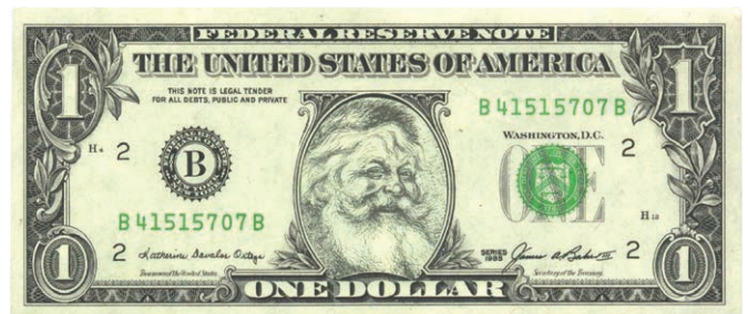
'Santa' 1985 Federal Reserve dollar, Fr-1913-B. Thomas Nast would have approved.

Of course for those of us of more modest means there is always a US Federal Reserve Bank dollar showing a smiling Santa Claus. These so-called 'Santa Dollars' are regular US dollar bills on which a seal with Santa's image is superimposed over George Washington. The seal can be removed if the giftee wishes to use the banknote as a normal $1 dollar bill. These cuties have been around since 1985.