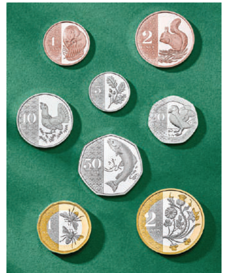
Reverses of the eight new definitive circulating coins of Great Britain that will be released towards the end of the year.

Inspired by The King's inaugural address on 9 September 2022 and personally approved by His Majesty, the edge inscription reads