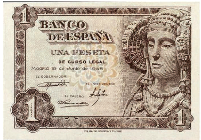
The Dame's second banknote appearance in 1948 on a regency Banco de España 1 peseta, P-135. Image Wikipedia Commons.

That illustrated in the Spink catalogue carries serial number 6853549 and the description acknowledges, "this note very rarely seen with serial numbers." However, it is unlikely to have been issued as it lacks the Cashier's (El Cajero) signature. It came graded EF and on the day realised $11,383 including commission.