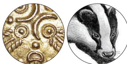
One of the hidden badger faces in the gold stater alongside the real McCoy. Note how the pairs of corn ears correspond to the black face stripes of the real badger.