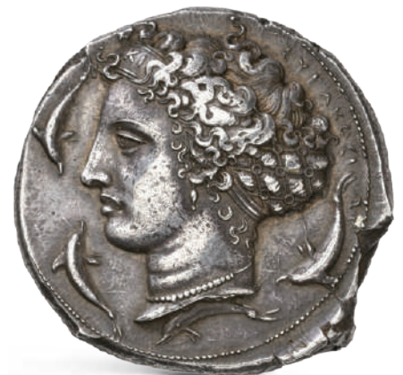
Obverse and reverse of silver dekadrachm from Syracuse c. 405 BC. Created and signed by Kimon (KI in headband) at the height of his skill it is regarded as "perhaps the most perfect specimen of its kind" and sold for $732,860.

winning charioteer with a wreath. Below in exergue are the trophies: a shield and cuirass between two greaves and a helmet.