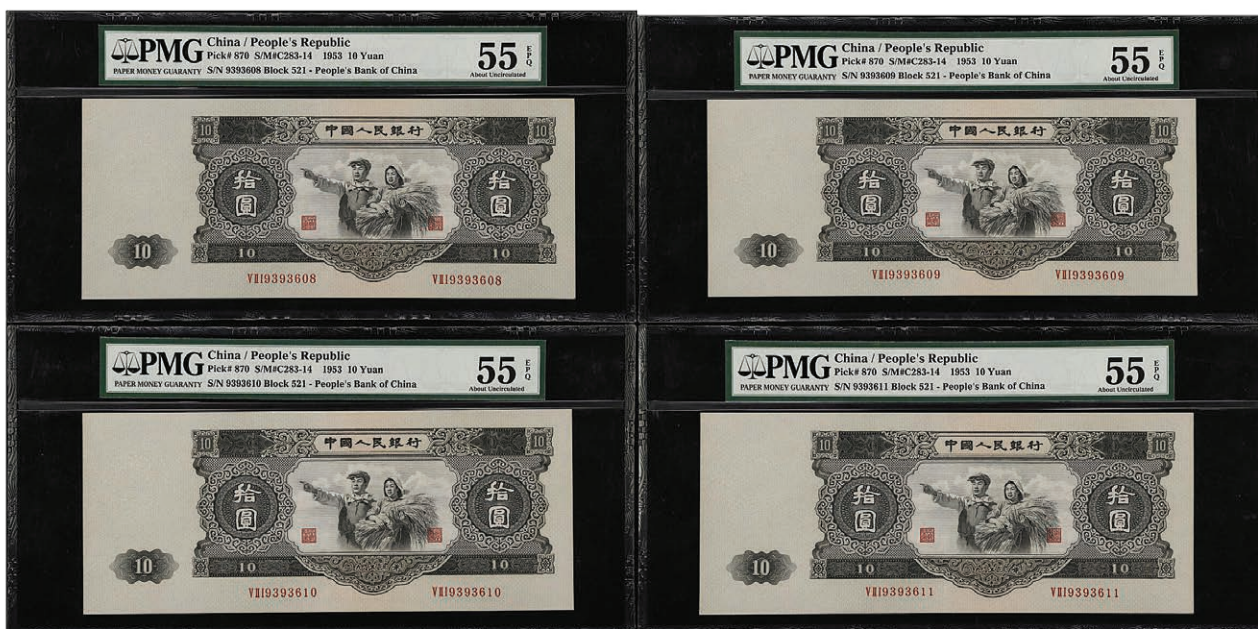
The four consecutive 10 yuan notes P-870 from the People's Republic of China second series renminbi that realised $677,540 in Stack's-Bowers 5 October Hong Kong sale. Despite what SCWPM says this note was not released until 1 December 1957. Note the absence of the numerals '4', '5' & '7' in the four serials.

On an opening price of US$300,000, the quartet was speedily bid up to US$432,000 [AU$677,540]. ■