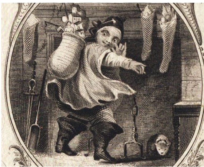
Saint Nicholas Bank of New York $1 proof featuring a Type II Santa, young and clean shaven. At left is portrait of Peter Stuyvesant. This specimen mounted on card came certified PCGS Very Choice New 64 when it sold for $5,750. The bank was liquidated on December 30 1882. All its bills, except for the $100 used a Santa vignette.

Meanwhile, back in Europe, a centuries-long conflation had been taking place of various gift-giving folk characters all of whom enjoyed mid-winter feasts. Sinterklaas was one; the Norse god Odin another; Father Christmas a third. Along the way the festivities were shifted from 6 December eve to 24 December to fit neatly with Christian celebration. In North America this blending of seasonal characters accelerated among the mix of colonial émigré groups from Europe.