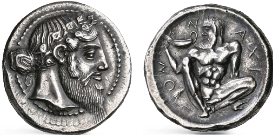
Obverse and reverse of silver tetradrachm from Naxos attributed to the Aitna Master. It has been described as, "One of the masterpieces of Greek art". That is god of wine, Dionysos, on the obverse and his drunken woodland companion, Silenos, on the reverse. Graded EF it realised $1,259,365.

BC from the city of Naxos, carried an estimate £400,000-600,000.