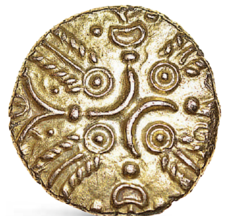
Obverse of Tasciovanos gold stater showing the four stylised badger faces plus a further four in hiding.