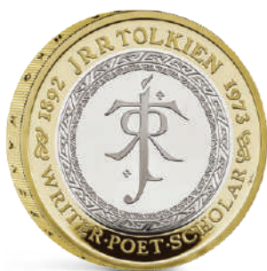
Gold proof £2 commemorating the death of JRR Tolkien 50 years ago. David Lawrence's reverse design shows Tolkien's monogram lying at the centre of an intricate runic pattern. The edge caption reads NOT ALL THOSE WHO WANDER ARE LOST.