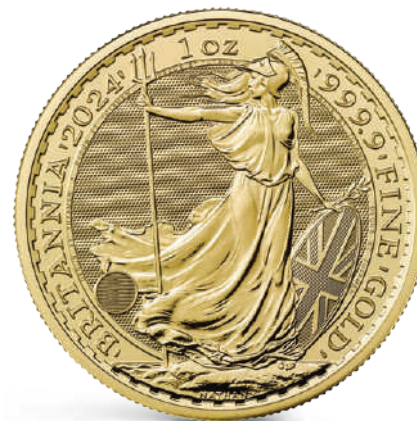
The silver obverse and gold reverse of the 2024 Britannia bullion pieces depicting Martin Jennings' portrait of King Charles and Philip Nathan's classic incarnation of Britannia.

bullion coins. There are four visual features that together verify each coin as the authentic when rotated in the light. These are a Latent Image that acts like a hologram and changes from a