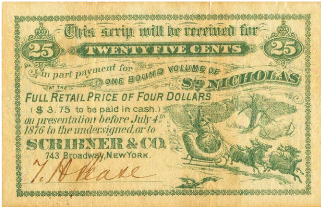
A distinctive Santa occurs on this piece of 1876 25c scrip of New York's Scribner & Co. It could be redeemed to reduce the $4 price of the book "St Nicholas" to $3.75. Only three examples are known. This one in PCGS Extremely Fine 45 realised $1,495.

Most Santa notes are sold in the US through the main auction houses such as Heritage and Stack's Bowers. Readers wishing to dabble in the Santa-on-notes market need to keep a regular eye on US currency listings from these auction houses.