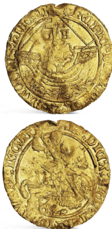
The George Noble of Henry VIII & Katherine of Aragon found in the backyard of a Tudor house in Chiltern Hills in January this year. It sold in September for $30,000.

On the day the coin was rapidly bid up to £15,600 [$30,000]. ■