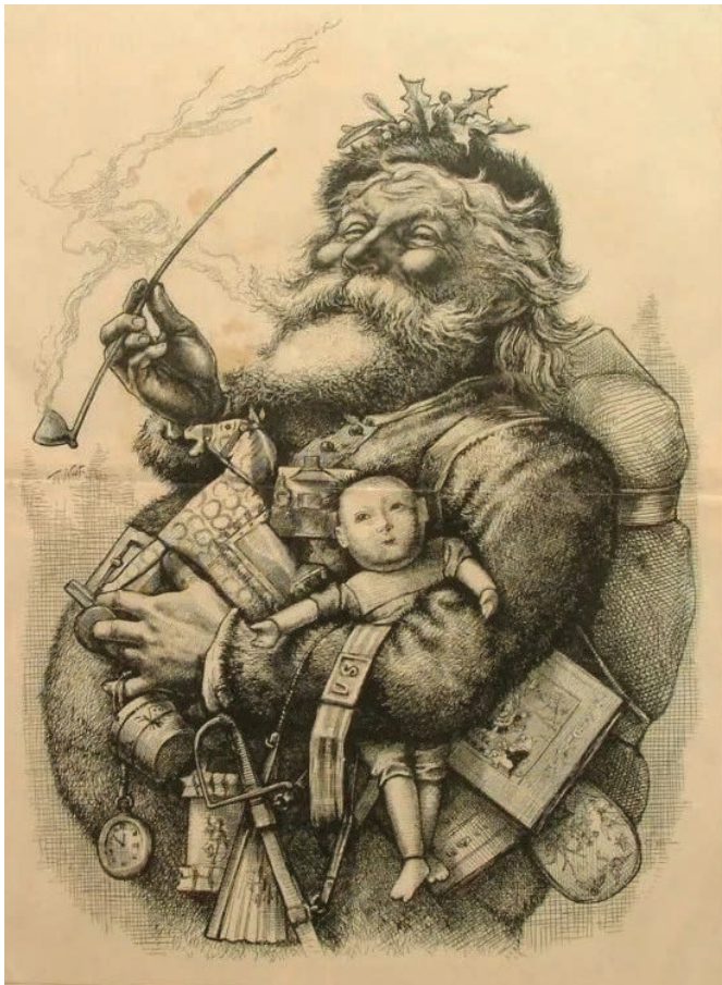
Artist Thomas Nast immortalised Santa Claus' current look with this drawing of, "Merry Old Santa Claus" in the 1 January 1881 edition of Harper's Weekly. Coloured versions of this image are a 20 th century embellishment.

And back in the late 1980s I was fortunate to acquire a choice Santa item in Down Town Sydney ex-circ; a piece of Dinkum Aussie political propaganda.