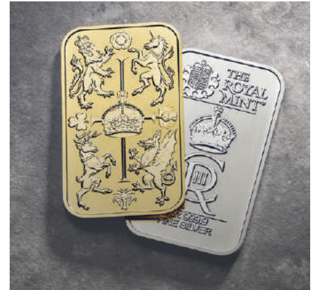
Gold & silver Royal Celebration Bullion Bars. The gold reverse features Thomas Docherty's depiction of the heraldic animals and flowers of the United Kingdom: The crowned Lion of England, The Unicorn of Scotland, The Red Dragon of Wales and The [extinct] Elk of Northern Ireland. The silver obverse shows the Royal Cypher. The letters consist of C for Charles and R for Rex with the '111' standing for the third Carolean era. Above is the Tudor crown worn also by Charles' grandfather George V1.

These Royal Celebration Bullion Bars are the first to represent His Majesty King Charles III. They are available in 1 oz gold, 1 oz silver and 10 oz silver and available for purchase from 22 September at www.royalmint.com . ■