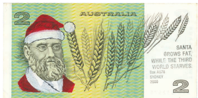
Political propaganda, Aussie style.

And a Very Merry Christmas to One and All. Ho! Ho! Ho! ■