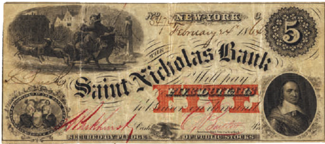
A unique $5 of February 24 1864 with a Type V Santa riding through the streets in his sleigh. Issued by the Saint Nicholas Bank it sold for $34,500 in PCGS Fine 15.