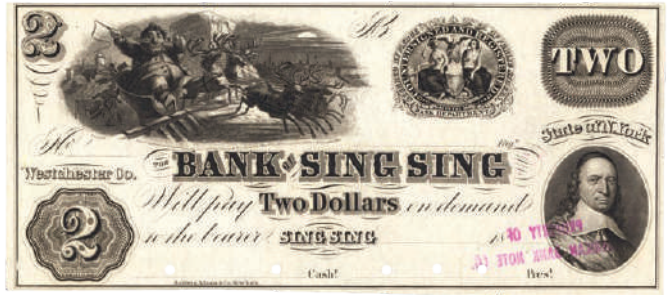
A Type III Santa is portrayed on the face of the Bank of Sing Sing $2 along with Peter Stuyvesant. Just six examples of the $2 are known. This proof in PCGS Apparent Choice About New 58 sold for $3,450.

Come 1809 Sinterklaas aka Santa Claus was being pictured as a tubby pipe-smoking Dutch sailor in a green winter coat. At first, this was little more than a send-up of Dutch colonial culture but the idea stuck. In 1823 it produced Clement Clarke Moore's widely published poem, A Visit From St Nicholas , later renamed, The Night Before Christmas .