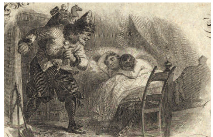
One of just three Type IV Santa Claus notes known. This $5 example from the Bank of Milwaukee is dated January 2 1855. From a gentler and more innocent time, Jolly Old St Nick is depicted leaving a doll for two girls asleep in their bed. Just two complete sets of this type of Santa note are known. This example sold for $23,000 in PCGS About New 58.