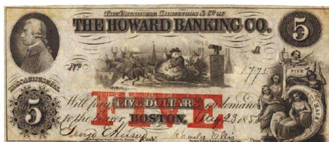
A well-executed Type I Dutch-style Santa features on this counterfeit $5 of the Howard Banking Company of 1858. About 75 of these counterfeit notes are known. This example sold for $1,437 in PCGS Extremely Fine 45.

Santa notes were issued in the US prior to the Civil War by state-chartered banks, similar institutions and businesses, i.e. they are part of what the Americans term 'Obsolete Bank Notes'. This was an important time for Santa. He was in the process of experiencing a major evolutionary growth spurt.