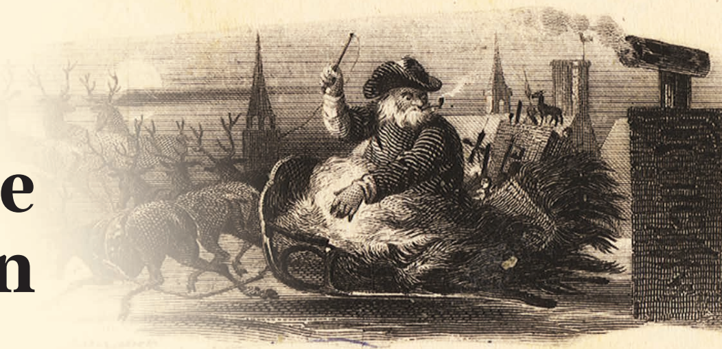
Santa Type I vignette featuring Santa Claus in his sleigh on a snowy rooftop.